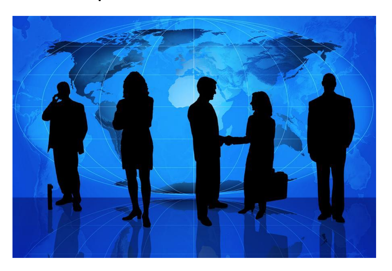
BFU: Capitalism and Investment